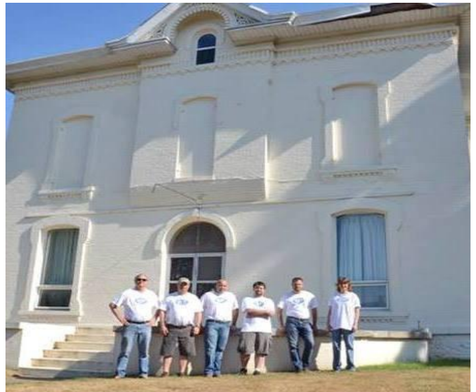
The Oneida Air Systems Team