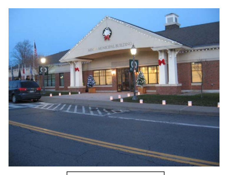
Decorated for the Holidays