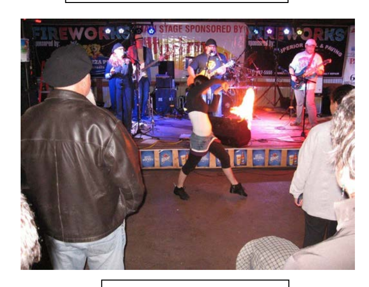
The Festival in the Park 2014