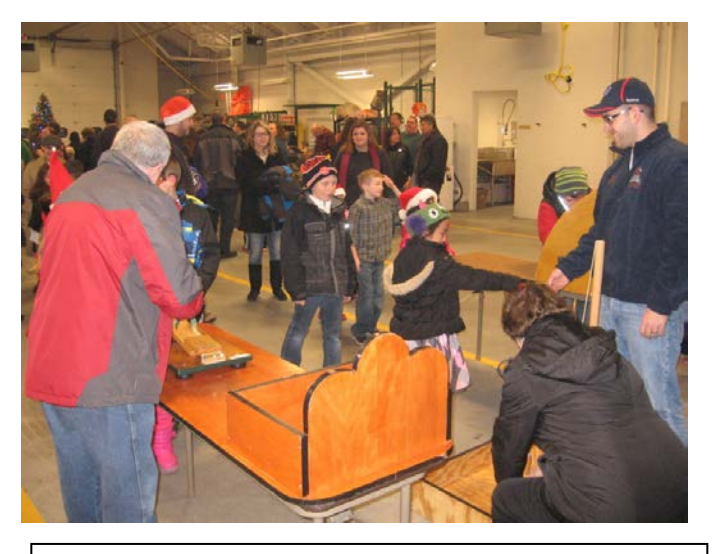
Children enjoying the games at the Tree Lighting Ceremony