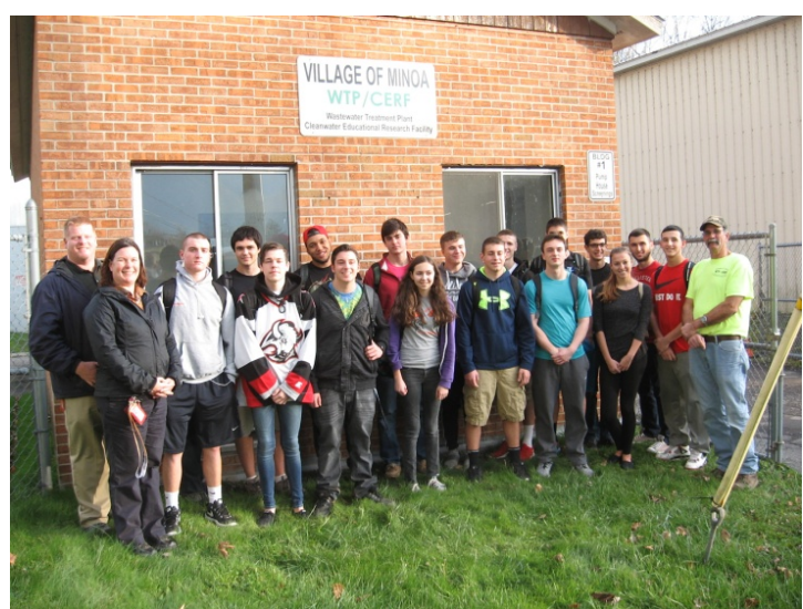
ESM Intern Students working at our plant