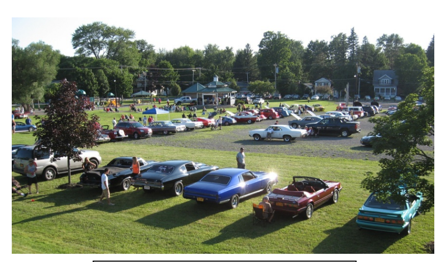
Friday Night Car Show and Concerts