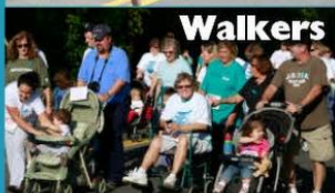
Families & Teams